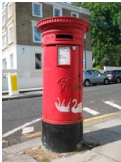
Victorian postbox (with modern graffiti!)

There are some fears that, if the Post Office is sold off, the new owners could want to dispense with the red post-boxes. The Council has therefore been investigating the possibility of having them listed by English Heritage. The Ladbroke Association has made a list of the pillar-boxes in the area to send to English Heritage. There is one Victorian one (on the corner of Lansdowne Walk and Clarendon Road), as well as four dating from the reign of Edward VII; seven from the reign of George V; and three Elizabeth II ones.