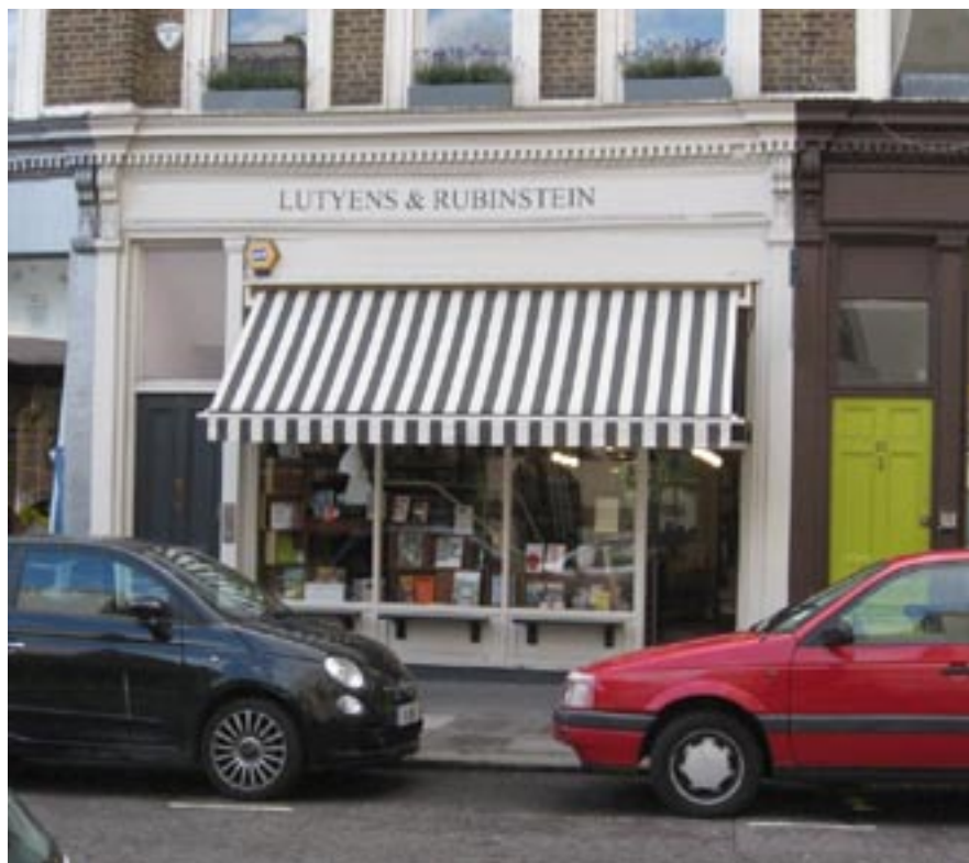
Bookshop at 21 Kensington Park Road

The new kids on the block, at 21 Kensington Park Road. It was opened in 2009 by literary agents Sarah Lutyens and Felicity Rubinstein, both of whom live nearby. They still operate their literary agency, from premises next to the shop. It is an independent generalist bookshop, and as such a brave venture, as it is only just round the corner from the much-