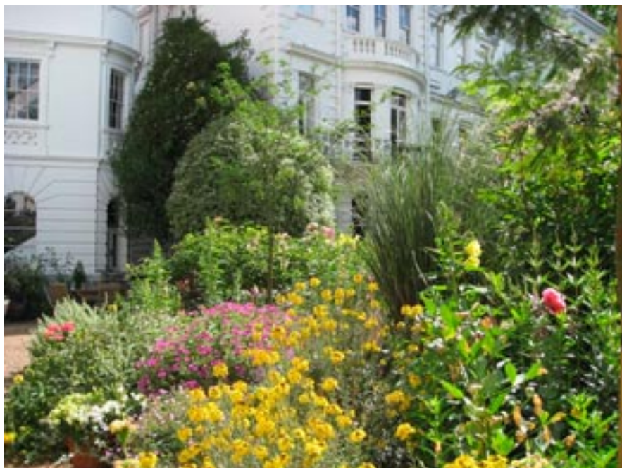
A communal garden in flower