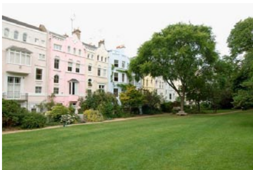
The elegant backs of houses in Lansdowne Road, as seen from the communal garden.