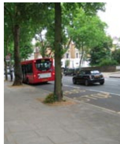
Over-large 228 Bus stop in Ladbrooke Grove next to Ladbrooke Square.

near the junction with Ladbrooke Terrace; outside Nos. 67 to 75 Ladbrooke Grove; in St. John's Gardens; and in Kensington Park Gardens, near the junction with Stanley Gardens.