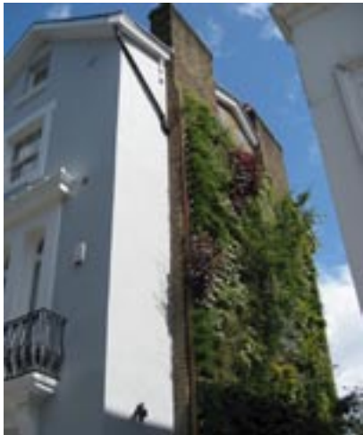
Green wall in Kensington Park Road

An interesting one was granted last year for a “green wall” on the side of No. 32 Kensington Park Road. It has now been installed and looks rather fine.