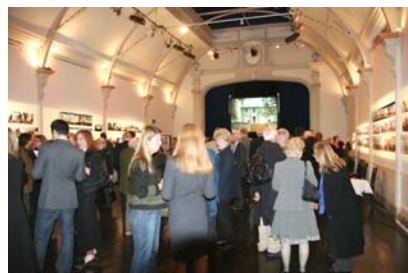
Visitors at the Exhibition

Our exhibition of photographs of the Ladbroke area on 16-17 October was extremely well received. The exhibition took place in the 20th Century Theatre on Westbourne Grove. Eighteen large panoramas of streets within the Ladbroke Estate were shown, along with a number of single images of buildings. In addition there was an impressive display of photography of St Peter's Church in Kensington Park Road ( see right ), assembled by the Church's Appeal Committee.