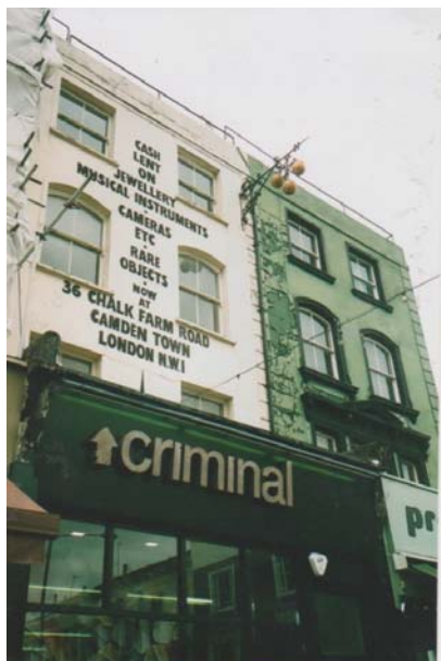
Pawnbroker's Balls Feature

It is not just the shop-fronts that are important, but also features on the façades.