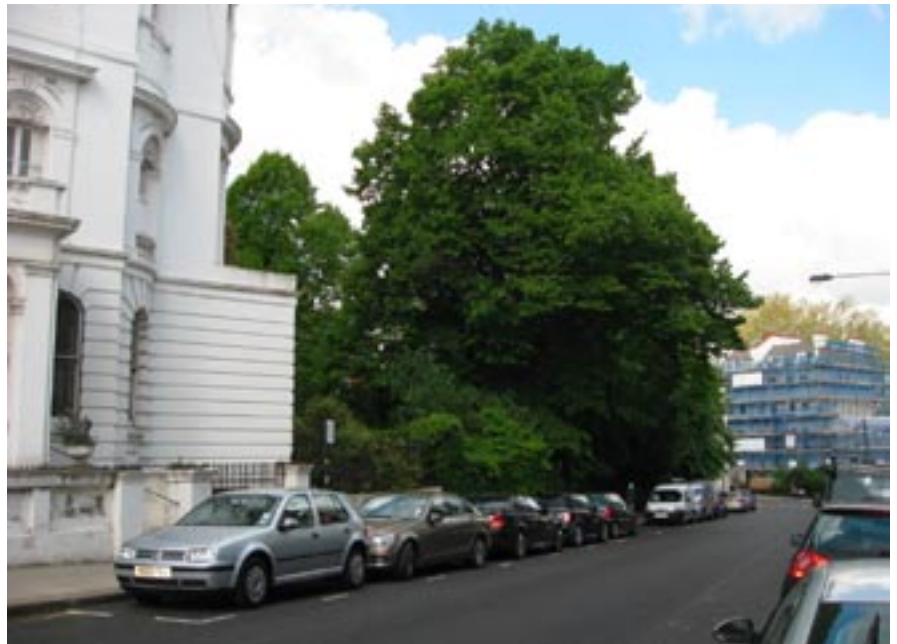
A magnificent communal garden tree overlooking Kensington Park Road.

If your tree overhangs a neighbour's property, he can cut it back to his boundary, although he must ask you whether you want the timber – and, if it is over the minimum width of trunk described above, he must seek permission from the council (which, oddly, can be done without the agreement of the owner of the tree).