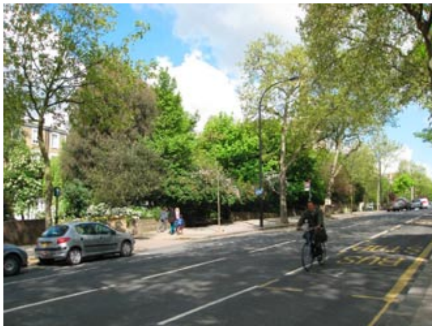
Trees in gardens along Ladbroke Grove.

In the Ladbroke area, as in other conservation areas, all trees with a trunk diameter of 75 mm (three inches) or more, at a height of 1.5 metres or more above the ground, have a degree of protection. Any person who wishes to prune them or cut them down must notify the Council six weeks in advance of the work. In the vast majority of cases there is no objection from the