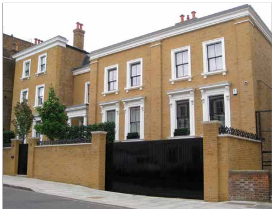
New Horbury Villa