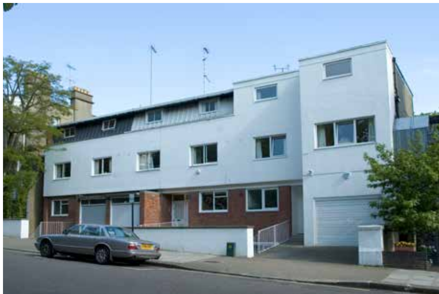
9-10 Lansdowne Walk in 2006