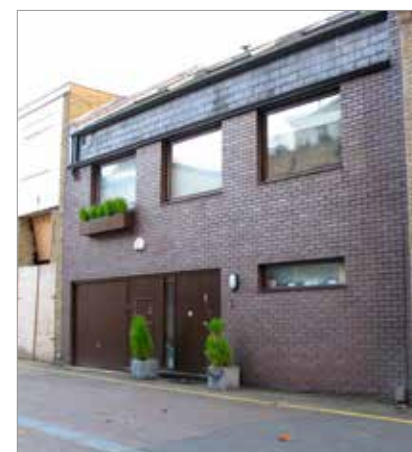
5 Boyne Terrace Mews