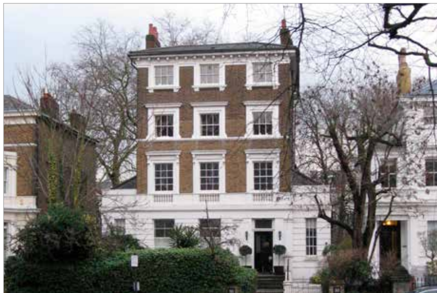
50 Ladbroke Grove

Building upwards is a favourite way of increasing the amount of space in one's house and a very large number of houses in the area have roof extensions, including some rather unfortunate ones from the aesthetics point of view. We certainly do not oppose all roof extensions. But, in the words of the Ladbroke Conservation Area Appraisal, there are some original roof forms that contribute strongly to the historic and architectural character of the conservation area and which we think it is important to preserve. We objected recently to two applications for roof extensions that we felt would compromise the buildings concerned, and we are happy to say that in both cases the applications were refused. One was for a roof extension to