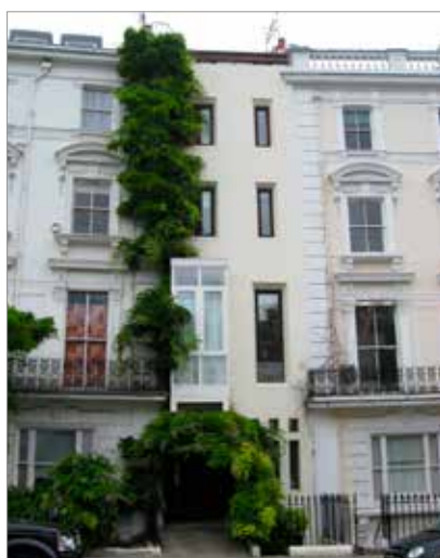
Infill house in Lansdowne Crescent

narrow gap between two terraces on Lansdowne Crescent. The front of wedge-shaped plot was no more than 13 feet 22 inches, but despite its narrow