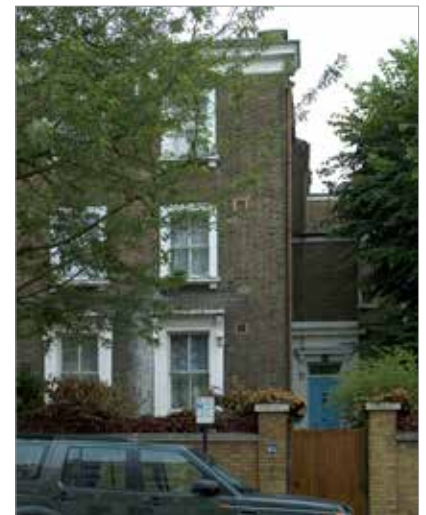
Original Horbury Villa

The new villa has incorporated the old building but effectively added four extra bays in a space previously occupied by garages and garden. Unlike the Ladbroke Grove house, it has stuck to the traditional style, we think quite successfully. Our main concern about both these houses is that solid walls and garage gates have been erected in front, quite out of character with our area, where the norm is railings and ironwork gates through which one can glimpse greenery and the architecture of the house behind. The huge black gates of Horbury Villa are particularly oppressive.