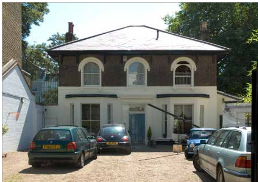
137 Blenheim Crescent in 2006

Victoria and Albert Museum and of the principal façade of Buckingham Palace. He completely transformed the house inside and out into a fine arts and crafts-style dwelling, moving the