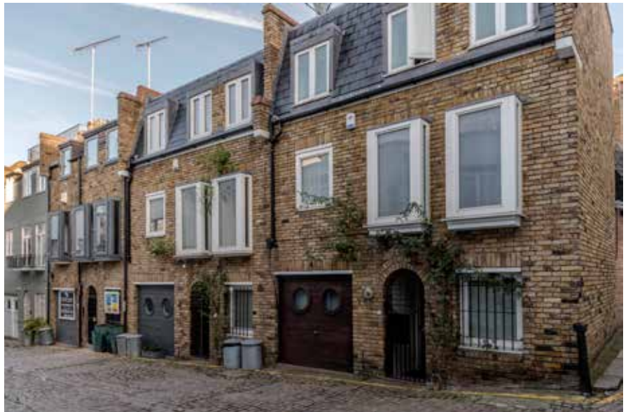
17-20 Vernon Yard

We keep an eye on changes to modern buildings as well as on those which are part of our Victorian heritage. This property is one of a group of four rather interestingly designed 1970s mews houses and we were not happy when an application was made to replace the modern garage door by a pseudo-stable door and the first floor windows by faux Georgian windows, which would have resulted in a real mish-mash of styles. Fortunately, the council agreed with us and the applicant was persuaded not to make these changes.