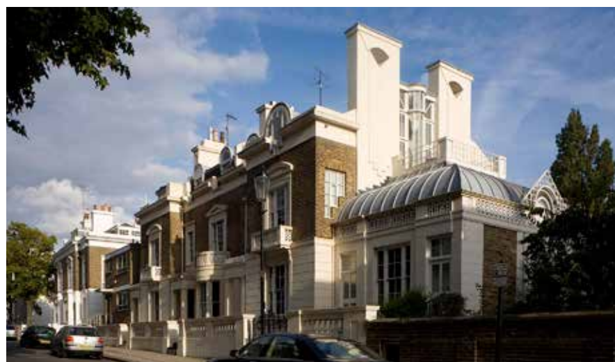
19 Lansdowne Walk in 2007