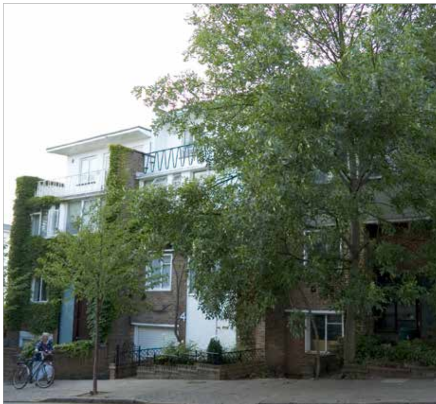
2, 4, 6 Lansdowne Rise in 2006

We also unsuccessfully objected to the white-flecked brick proposed. This type of brick (the brick equivalent of limed oak) seems to be the current architectural fad and is attractive, but it just makes for a visual muddle to use it in an area where there are already two other types of brick in use on neighbouring properties (London stock and red brick). It also seemed to us questionable, given the pressure on housing in the Borough, whether it made sense to replace three housing units by two.