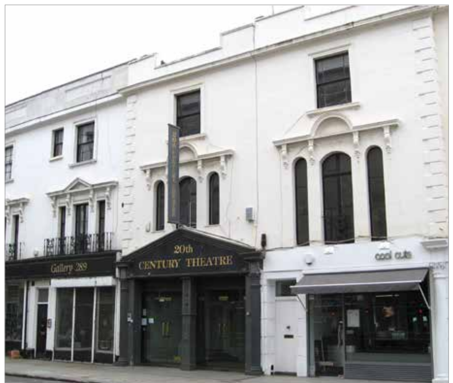
20th Century Theatre

launches etc, as well as charity events. Unfortunately, last year her lease was not renewed and the antique dealers who operated in an arcade under the theatre have also had to leave. We understand that the landlord is now seeking to rent the whole building out for retail purposes. The new tenant will, however, be severely restricted by the building's Grade II listing, as a "rare survival of a rectangular hall-type theatre with a gallery along one end".