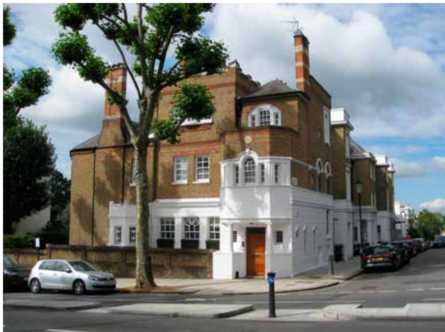
Sir Aston Webb's house at 1 Lansdowne Walk